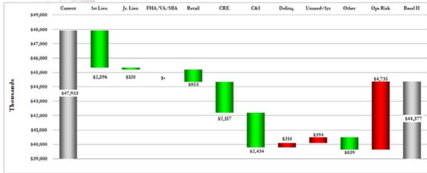
Capital Savings Percentile