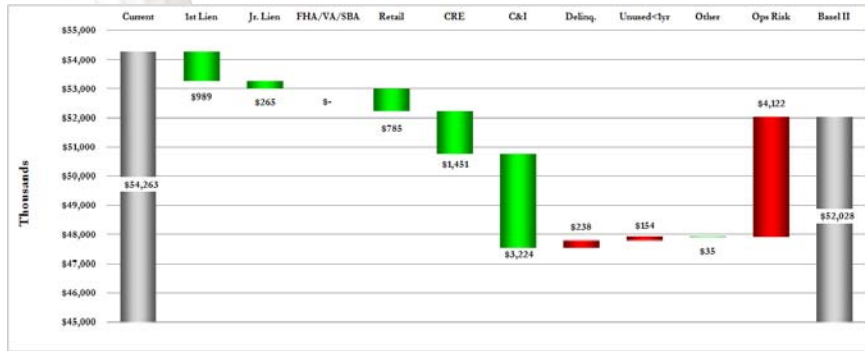
Capital Savings Percentile